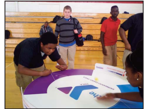
It's getting serious now!

First, our partnership will assist in preparing our students to further their education by providing another outlet to develop their strategic thinking, to improve their