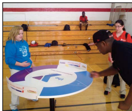
Bullet Ball in action

BulletBall is also enjoyed as recreation and recreational therapy at the YMCA, Youth and Family Centers, VA Medical Centers, hospitals, Parquad Independent Living Facility, rehabilitation institutions, parks and recreation, AccessChicago, and in the home.